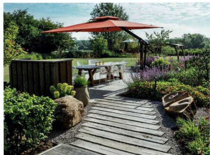
ABOVE LEFT AND BOTTOM RIGHT: the series of garden rooms is arranged so they draw you towards and away from the house. TOP RIGHT: Fiona's pergola design of black-painted oak posts and cross beams, with stainless steel cabling that supports a wisteria.

T he best clients are those who give a clear brief and a free rein. Such was the case with Lois and Patrick Bellew, when they asked Fiona Harrison MSGD to turn their 0.7-acre garden, a windswept L-shaped lawn that wraps around their converted barn in north-east Hampshire, into something more intimate and inviting.